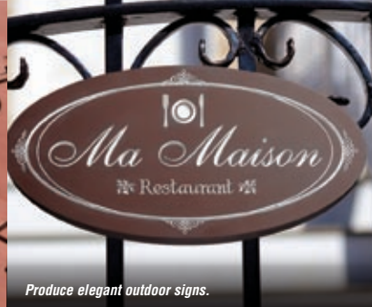
Produce elegant outdoor signs.