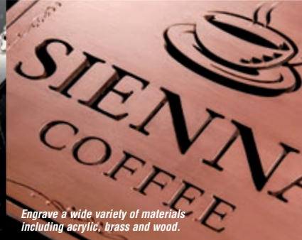
Engrave a wide variety of materials including acrylic, brass and wood.