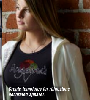
Create templates for rhinestone decorated apparel.