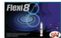
FlexiENGRAVE8 Software quickly handles the most complex designs to simple name tags.

A complete selection of vises, tools and software ensure that the EGX-350 can handle any job.