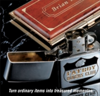
Turn ordinary items into treasured mementos.