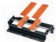
Center Vise holds objects up to 5.9" (X) x 5.8" (Y) x 1.3" (Z).